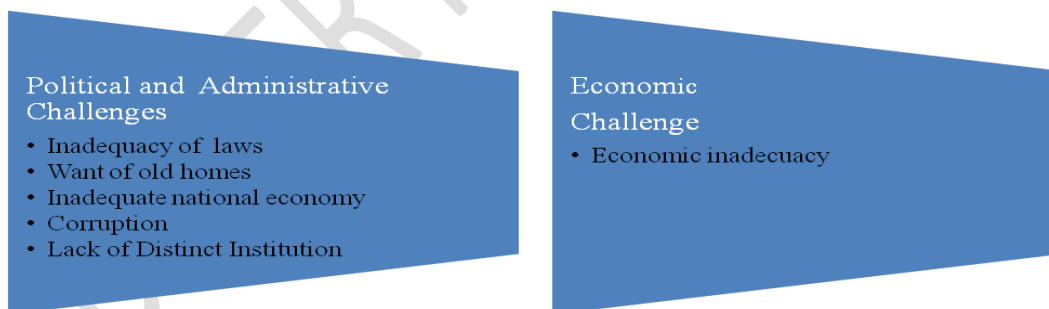
Figure 1: Political, Administrative and Economic Challenges

However, this study reveals some specific challenges on the ground of human rights of the senior citizens of Bangladesh. These challenges are categorized into political, administrative and social challenges. The political, administrative and economic challenges are depicted in the below.