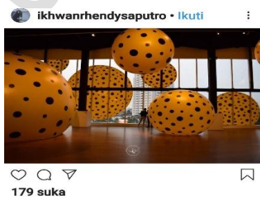
234 Figure 4: Obsession Dots