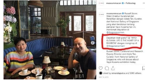
Figure 9: Can stay package program Free admission to the Macan Museum