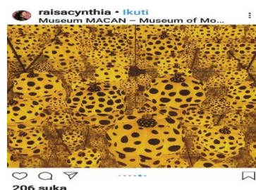
Figure 5: Pumpkins in Obsession Dots