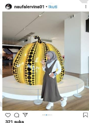
222 Figure 3: Great Gigantic Pumpkin