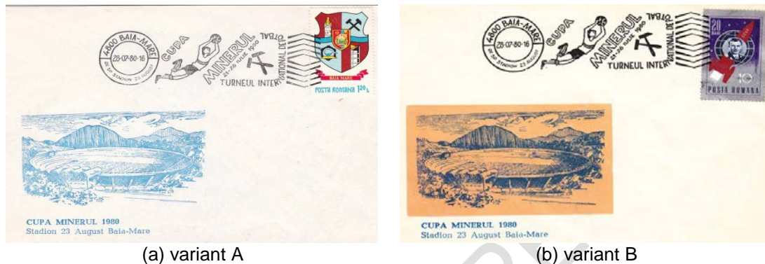
Fig. 7. Occasional envelope - Minerul Cup 1980, Baia Mare

The image of the "August 23" Stadium in Baia Mare was used to create two special envelopes that bore the occasional stamp. The first variant (A) shows the stadium on a white background (Fig. 7a) [36, 37], while the second variant (B) presents the semi-illustration on a yellow background (Fig. 7b) [38].