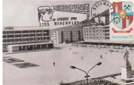
(b) variant B