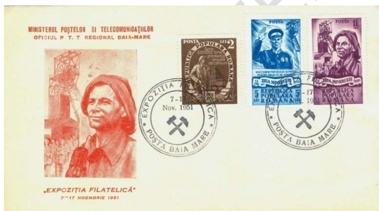
Fig. 1. Occasional envelope - 7-17.11.1951 - "Philatelic exhibition" in Baia Mare

During the period November 7-17, 1951, in Baia Mare, the first philatelic exhibition in the county, held to celebrate "Miner's Day" was organized. With this exhibition, an occasional envelope (see Fig. 1) was published by the Ministry of Posts and Telecommunications through the P.T.T. Regional of Baia Mare [11, 12]. It is worth mentioning that, after the exhibition in Constanța in July of the same year, the exhibition hosted in Baia Mare was the second philatelic exhibition in the country. For the creation of this philatelic piece, the first one with this theme addressed in our county has used the image used to make the envelope "the first day" (First Day Cover - FDC) of the issue "Miner's Day" appeared on August 12, 1951. This time the color of the pattern was it was red, and the legends were changed.