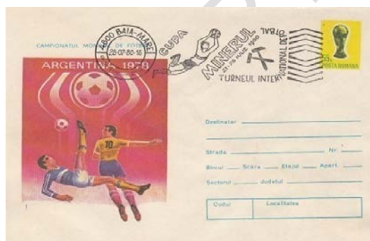
Fig. 8. Special stamp applied to the entire postcard of W.C. of Argentina football 1978

Variant A was stamped with the nominal value of 1.20 lei with the coat of arms of Baia Mare Municipality, a piece published in 1979 (LP #994), while variant B was stamped using the stamp with the 20-money denomination of the "10 years" issue. of cosmonautics "(LP #642), a piece published on February 10, 1967. In Fig. 8 [39] the stamp was applied to an entire postcard (code 0119/1978), not circulated, issued on the occasion of the World Football Championship in Argentina. The envelope is part of a series of six pieces, with the fixed mark of 55 money representing the cup of the world football championship on a yellow background. The sale price of the entire post office was 1 leu.