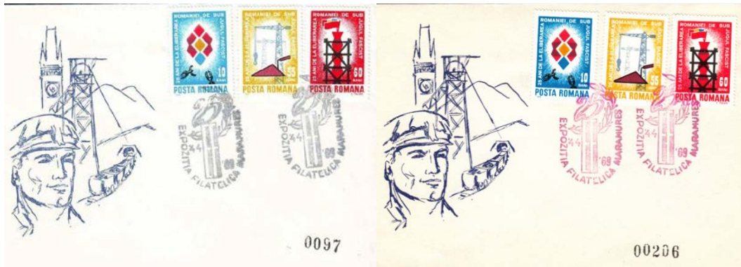
Fig. 3. Two occasional envelopes from the 1969 Maramureș Philatelic Exhibition

The envelopes are obliterated with the stamps of the show "25th anniversary of the liberation of the homeland" (LP #707) published on August 23, 1969 - and this time the stamp is a purely philatelic one. The stamp of the exhibition was applied in two shades of ink (black and red). The envelopes were numbered and the print run was high (if we rely on the number of characters in the counter - probably somewhere around 10,000 copies).