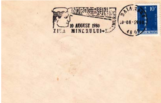
(a) variant A

In Fig. 9a [40] we rendered the image of an envelope "in white" which was crossed with the stamp of 10 bani from the usual program "Monuments" (LP #837) published on December 15, 1973, representing the infinity column from Târgu Jiu of the great sculptor Constantin Brâncuși. Others, more daring, tried to achieve a maximum (Fig. 9b) [41] using as a support a black and white postcard, which, in the right-front plane, can be seen the statue "Miner" (rear view). As a postmark, they used the stamp with the coat of arms of the municipality of Baia Mare, which presents as thematic elements the chisel and the hammer. Both pieces were obliterated with the stamp made by the Baia Mare philatelists.