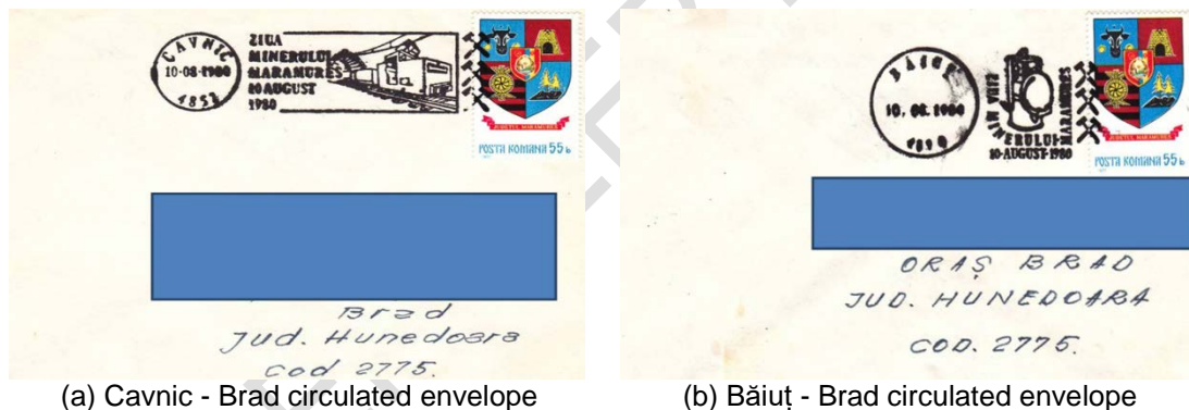
Fig. 11. Different envelopes with the occasional stamp

Even in Băiuţ there were organized events on this occasion. The stamp applied here presents as a graphic element in the layout a mine lamp framed by the legend "MINER'S DAY / MARAMUREŞ / 10-AUGUST-1980" and bordered, on the right, by the symbol of the chisel and the hammer. In Fig. 11b [45] we find a letter circulated from Băiuţ to Brad bearing the special stamp of the event. And this letter also reached its destination in two days. For those who were curious to follow the sources cited, they could see that the last two reproductions circulated have the same sender Dobra Ioan - a Baia Mare philatelist of the time. Perhaps readers who do not know the Maramures area very well will wonder how this person managed to be in two locations at the same time.