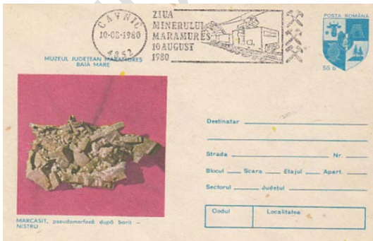
(a) variant A

The first piece identified (Fig. 10a) [42] by us bears the special stamp applied on the entire postcode 0437/1976, a series of 12 semi-illustrated envelopes with samples from the Maramureș County Museum - Baia Mare. The present piece (with a fixed stamp with the name of 55 bani and the sale price 1 leu) presents a beautiful specimen of marcasite, a pseudomorphosis after baritine, extracted from the Nistru mine.