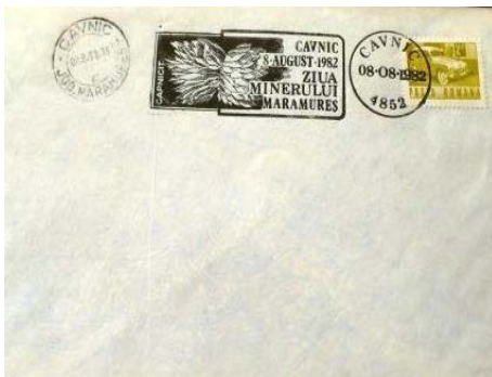
Fig. 13. Envelope with the stamp "Miner Maramures Day 1982", Cavnic

Not every year "Miner's Day" would be celebrated on the same date. For example, in 1982 it was to be celebrated, at Cavnic, on August 8. This time the stamp (Fig. 13) [48] was to bear the artistic signs of an artist passionate about the abstract. The connection between the stylization of the mineral and the legend of the stamp "Cavnic / August 08, 1982, / Day / Miner / Maramureș" was made in interlocking boxes, the circle with the date and the place of the shipment being located on the right, with the role of forgetting the stamp with which it was equipped.