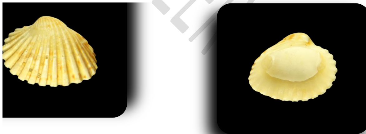
a. Dorsal view

The new record was identified from the Kutubdia Island, Bangladesh. This species is common and mostly found in mangrove planted intertidal (sandy-muddy) area. Siddique et al. [11] had noticed that the habitats of the species from same genus (Table 1) were between St. Martin Island and Sonadia Island, widespread in the Indo Pacific from East Africa to the Philippines, Taiwan and Indonesia, including India, Myanmar and Sri Lanka [11]. The species was also reported from coastal area of North and South Pacific Ocean (WoRMS), SW Mexico to Chile [17], and Pacific coast of California [15].