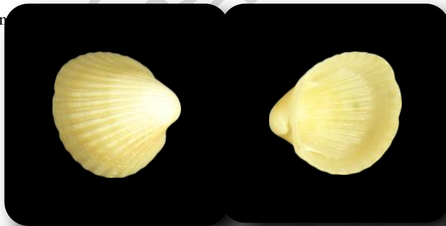
a. Dorsal view

The new record for Parvicardium exigum was discovered from the Kutubdia Island, Bangladesh. The species are mostly available and found only in sandy-muddy zone of the intertidal area. It prefers an aerial exposure on 0-5% and is found in rough sand and sand gravel spun with a byssus thread [18]. The genus of the family was found in intertidal and shallow sublittoral waters to a depth of about 15 m [11]. It was also found on the rock under algae with byssal attachment [19]. The species was also reported from widely distributed coastal area of Norway to the Mediterranean common [17].