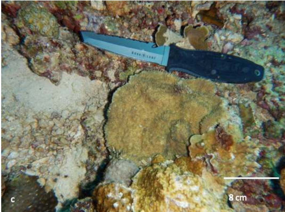
Figure 1 Podabacia kunzmanni at different depths: a) small (in 4 m), b) large (in 10 m) and c) very large (in 18 m), all attached to coral rock.