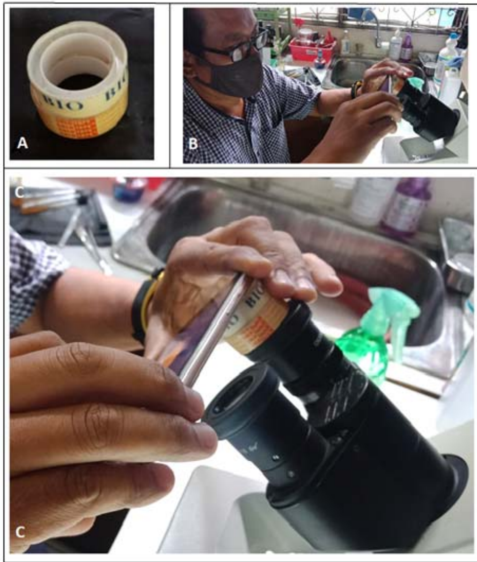
Fig. 1. A. small sized cello tape used as an external adaptor-like for the smartphone. B. Setting the smartphone so that it can rely on the cello tape. C. Left hand can hold the smartphone, and with the free right hand can adjust the microscope settings (e.g. aperture for light), and after the best image seen, the right hand's finger can push the button of the camera.

The result of the photographs taken using the Urip Susiantoro technique is nice and as beautiful as the real object. It is usually quiet small, but with the enlargement feature that usually exists in the smartphone, it is so easy to make the picture bigger, and adjusted in size as needed. It is recommended that each first photograph taken saved to the memory of the smartphone before the picture being photographically adjusted.