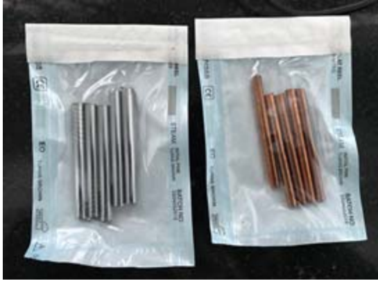
Figure 1 : Stainless steel and copper suction tubes in separate autoclaved pouches ready to be immersed in the bacterial suspension.