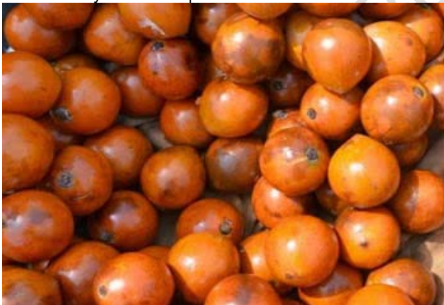
Plate 1: African star apple fruit [14]