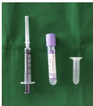
Fig 1: A sterile 2ml syringe, 3 ml EDTA infused tube for serum collection, 2.5 ml Eppendorf vial for saliva collection.

a.m. immediately after obtainment of the sera samples. Patients were asked not to eat, drink, or smoke 2 h before salivary collection. The patients were asked to sit in the dental chair with head tilted forward and instructed not to speak, swallow, or do any head movements during collection of the sample. The patients were then instructed to spit the saliva into a sterile Eppendorf vial every minute for about 5 min. Saliva of about 2 ml was collected. The sample was centrifuged at 3000 rpm for about 20 min and clear supernatants were processed immediately for estimation of salivary levels glucose, amylase, and total protein. The test sample (100 \mu l) was mixed with the glucose reagent in a ratio of 1:3 and glucose standard and incubated at 37°C for 5 min. The absorbance values were measured on Erba Chem 7, semi-automated analyzer.