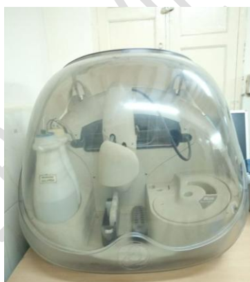
Fig 2: Semi automated analyzer