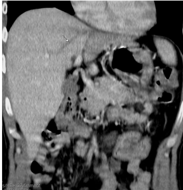
Fig.2: Coronal section of an abdominal angioscanner showing the absence of opacification of the medial suprahepatic vein (arrow).

The patient was treated with hydroxychloroquine and long-term corticosteroid therapy with favorable clinical and radiologic outcomes. During the follow-up, the patient reported right hypochondrial pain. The laboratory workup revealed a prothrombin level of 76%, seven-times-normal anicteric biological cholestasis, and a twice-normal cytolytic. The hepatic angioscanner revealed an absence of opacification of the left and median supra-hepatic veins with perfusion abnormalities in the left liver, all consistent with BCS (fig.2). Fibroscopy revealed grade I esophageal varices.