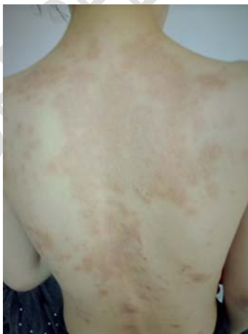
Fig.1: Extensive erythematous squamous lesions on the back.

We report the (In present report ) a case of a 38-year-old patient with a 4-year history of type 2 diabetes and 8-year history of multisystemic sarcoidosis with skin, lymph node and lung involvement ( was reported at .....place of institution or locality ). The diagnosis was established in front of several findings: disseminated erythematous squamous papular plaques (Fig.1), hypercalcemia, elevation of angiotensin II converting enzyme, hilar and mediastinal adenopathies with pulmonary parenchymal involvement associated with cutaneous and bronchial granulomatosis.