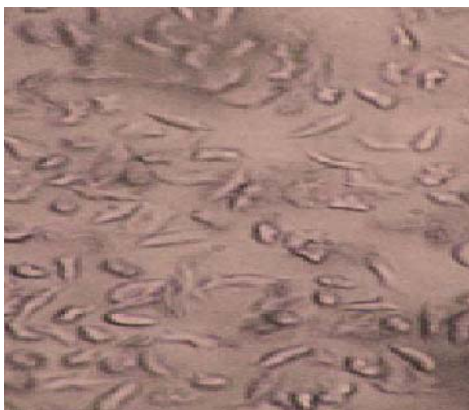
Fig.1: Optical microphotography of untreated SS blood erythrocytes (control)[NaCl 0.9%, Na 2 S 2 O 5 2%,Magnification 500 X].

The figure 1 shows a micrograph of the sickle cell blood alone and the figure 2 give for illustration a micrograph of sickle cell blood in the presence of aqueous extract of Annona senegalensis leaves