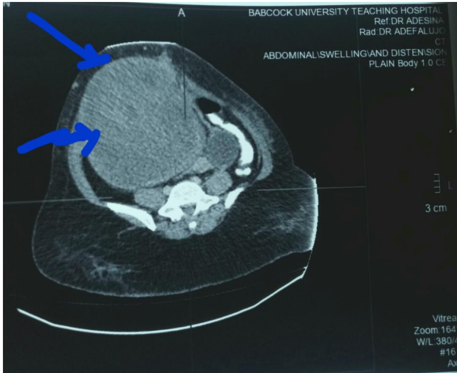
Figure 1: Computed Tomography scanogram showing huge mixed density mass