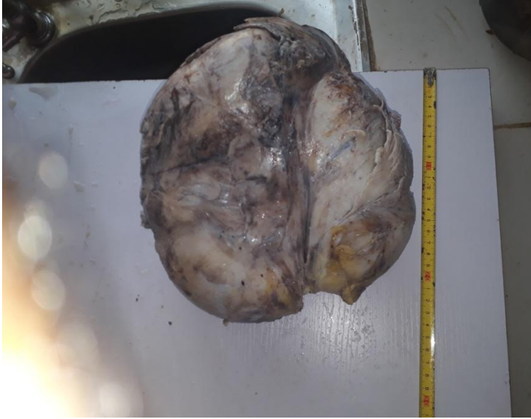
Figure 3: Photograph of the macroscopic finding of the tumour