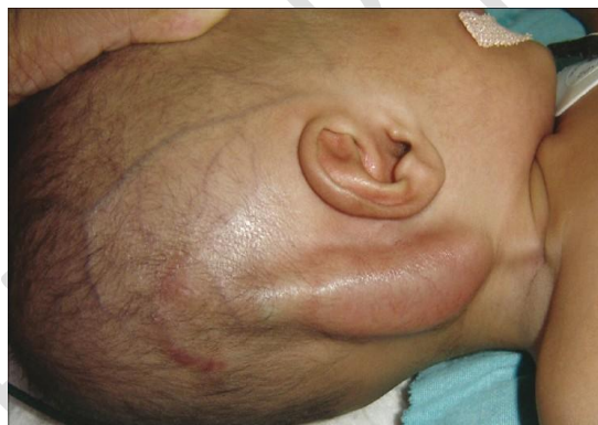
FIG.2. Shows CSF collection under the skin at the site of parieto-occipital burr hole.