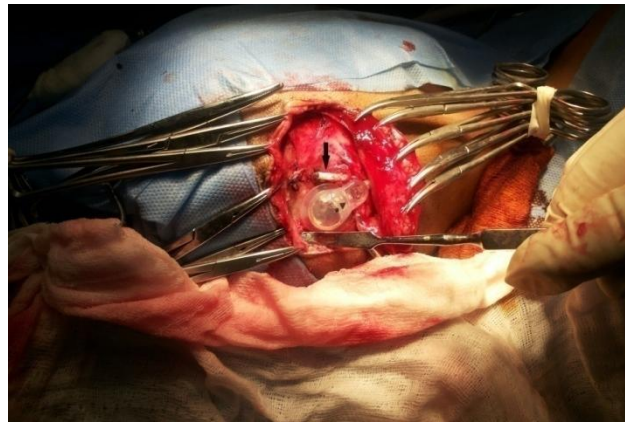
FIG.1. Black arrow shows ventricular catheter migrated outside the ventricle