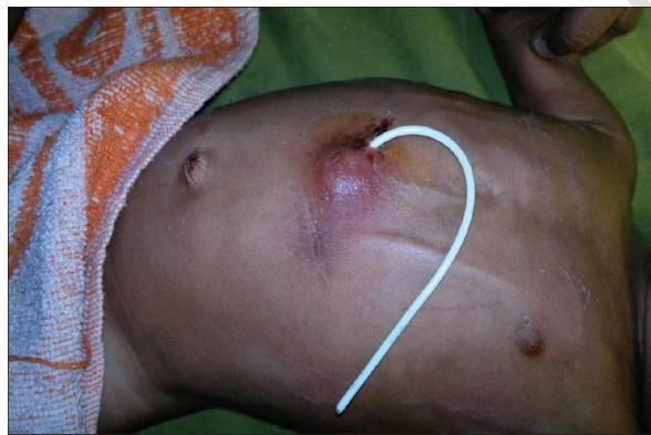
FIG. 4. Distal catheter exposure.