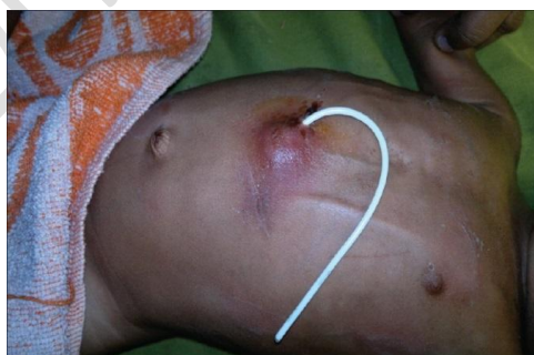
FIG. 4. Distal catheter exposure.