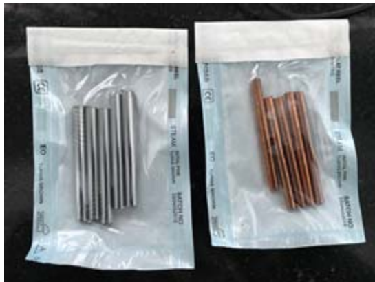
Figure 1 : Stainless steel and copper suction tubes in separate autoclaved pouches ready to be immersed in the bacterial suspension.