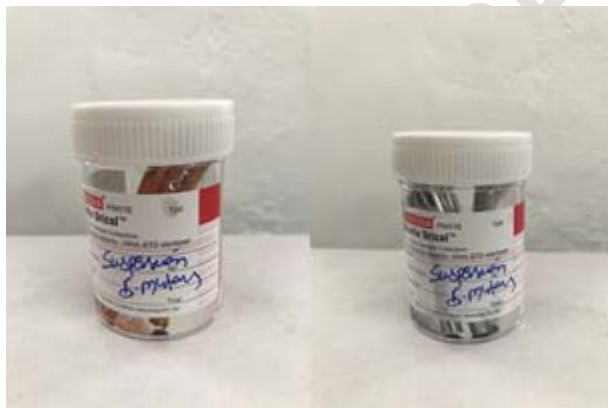
Figure 2: Sterile airtight holding containers with labels according to the groups.