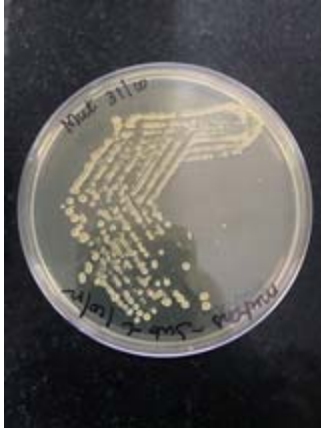
Figure 3: Streptococcus Mutans strain used for the study.