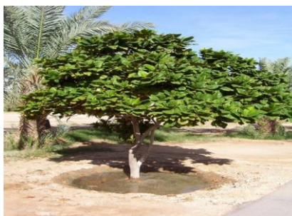
Figure 1: Terminalia catappa [3]

The plants have traditionally been a strong source of anti-infective agents. Plant-based antimicrobials are a huge