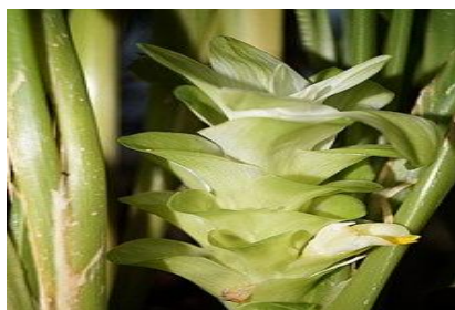
Figure 2: Curcuma longa[4]