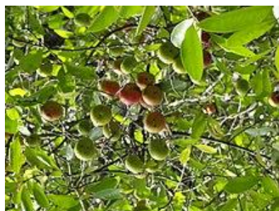
Figure 3: Garcinia indica[5]