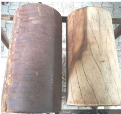
Fig.2. Threshing mechanism-Drive (Wood) and driven (Iron) rollers