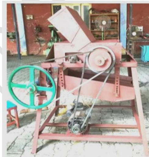
Fig.3. Power operated portable sesame thresher