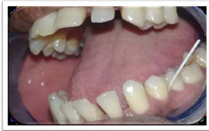
Fig.1: GCF sampling by paper point size 4