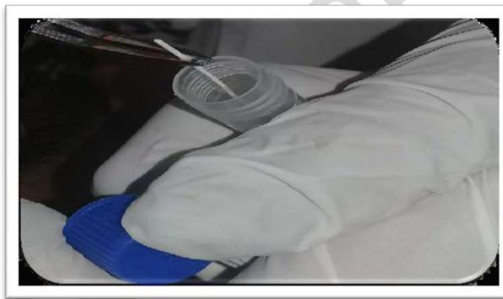
Fig.2: collection of sample in cryo-vial