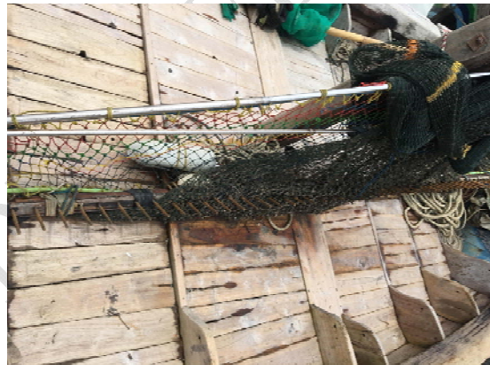
Figure 1. Sea cucumber dredge gear

The fishing gear identified (Figure 1) during the study totaled 55 with different specifications for each component. The difference in the size of each dredge gear component affects the extent of the swept area and the number of catches per fishing gear operation. The constituents of 55 tools were identified as 28 iron-based and 27 stainless-steel based.