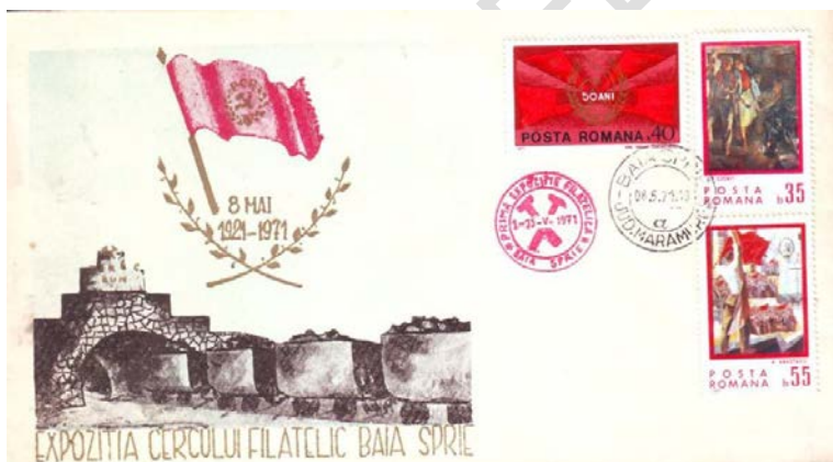
Fig. 5. Occasional envelope made at the Baia Sprie Philatelic Circle Exhibition in 1971

The envelope was stamped with the stamp of the show "Victory on Fascism" (LP #727) which appeared on May 9, 1970, and was obliterated by the day stamp of the Cavnic Post Office on August 3, 1970. The exhibition stamp in which the miner's face appears in the illustration of the occasional envelope was presented in a complementary black ink, next to the AFR logo. Established in 1970, the Baia Sprie Philatelic Circle has enjoyed from the beginning an active and creative collection. In this context, even in the second year of existence, the group holds its first philatelic exhibition, which took place on May 1-25, 1971. The occasional envelope of Fig. 5 [33] presents in semi-illustration a convoy of ore wagons loaded at the mouth of the mine in the city of Baia Sprie, having above them a laurel wreath that fits the party flag (PCR), as well as the text "May 8, 1921-1971". It is printed using two colours for the first time in Maramures.