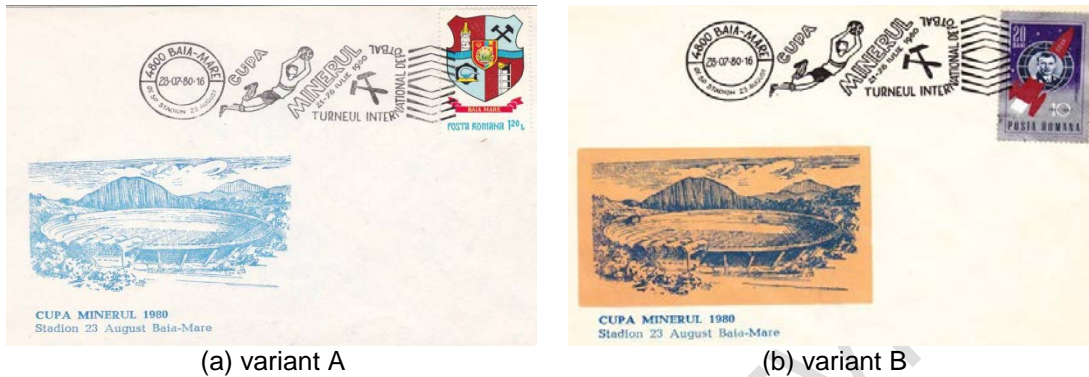
Fig. 7. Occasional envelope - Minerul Cup 1980, Baia Mare

chisel and hammer were used in the graphic element - symbols specific to the mining activity. The image of the "August 23" Stadium in Baia Mare was used to create two special envelopes that bore the occasional stamp. The first variant (A) shows the stadium on a white background (Fig. 7a) [36, 37], while the second variant (B) presents the semi-illustration on a yellow background (Fig. 7b) [38].