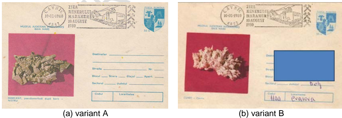
Fig. 10. A special stamp applied to different philatelic products, Cavnic post office

At the Cavnic, a stamp was designed in which an electrically operated mine train can be observed. The legend "ZIUA / MINERULUI / MARAMUREȘ / 10 AUGUST / 1980" is aligned on the left side of the graphic box, being bordered by the chiseled pair and the hammer arranged three times, vertically, on the right. The first piece identified (Fig. 10a) [42] by us bears the special stamp applied on the entire postcode 0437/1976, a series of 12 semi-illustrated envelopes with samples from the Maramureș County Museum - Baia Mare. The present piece (with a fixed stamp with the name of 55 bani and the sale price 1 leu) presents a beautiful specimen of marcasite, a pseudomorphosis after baritone, extracted from the Nistru mine.