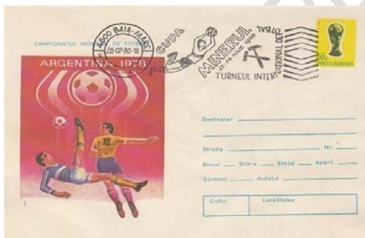
Fig. 8. Special stamp applied to the entire postcard of W.C. of Argentina football 1978

Variant A was stamped with the nominal value of 1.20 lei with the coat of arms of Baia Mare Municipality, a piece published in 1979 (LP #994), while variant B was stamped using the stamp with the 20-money denomination of the "10 years" issue. of cosmonautics "(LP #642), a piece published on February 10, 1967. In Fig. 8 [39] the stamp was applied to an entire postcard (code 0119/1978), not circulated, issued on the occasion of the World Football Championship in Argentina. The envelope is part of a series of six pieces, with the fixed mark of 55 money representing the cup of the world football championship on a yellow background. The sale price of the entire post office was 1 leu.