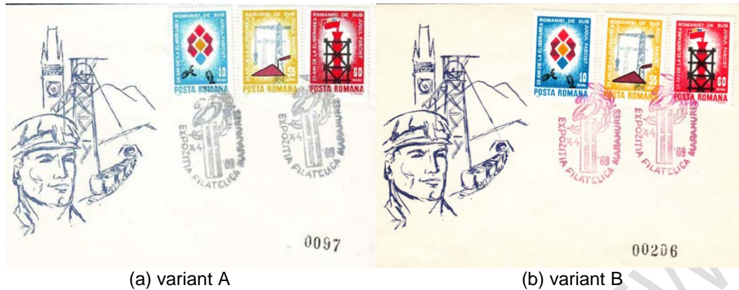
Fig. 3. Two occasional envelopes from the 1969 Maramures Philatelic Exhibition

The view of the stamps is obstructed by the label "25 th anniversary of the liberation of the homeland" (LP #707) published on August 23, 1969 - and this time the stamp is a purely philatelic one. The stamp of the exhibition was applied in two shades of ink (black and red). The envelopes were numbered and the print run was high (if we rely on the number of characters in the counter - probably somewhere around 10,000 copies).