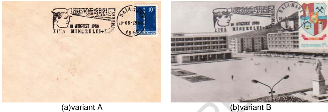
Fig. 9. A special stamp applied to different philatelic products, Baia Mare post office

In Fig. 9a [40] we rendered the image of an envelope "in white" which was crossed with the stamp of 10 bani from the usual program "Monuments" (LP #837) published on December 15, 1973, representing the infinity column from Târgu Jiu of the great sculptor Constantin Brâncuși. Others, more daring, tried to achieve a maximum (Fig. 9b) [41] using as a support a black and white postcard, which, in the right-front plane, displays the "Minerstatue" (rear view). As a postmark, they used the stamp with the coat of arms of the municipality of Baia Mare, which presents as thematic elements the chisel and the hammer. Both pieces were obliterated with the stamp made by the Baia Mare philatelists.