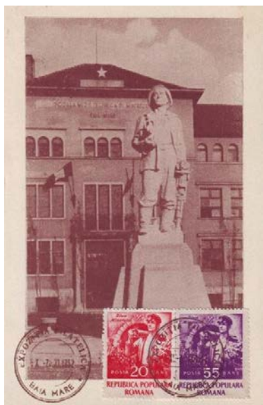
Fig. 2. Maximum postcard - "Philatelic Exhibition" in Baia Mare - November 6-20, 1952

Seven years later (August 9, 1958) it was replaced with a similar work that exists today. We invite you to find out, by reading the article mentioned in the bibliography [21], why the two statues were changed and what is the mystery around them. The postage is also a purely philatelic one. It keeping the theme of the exhibition, the resulting nominal value not being under the postal rates in effect at that date. The round stamp of the exhibition was applied in brown ink, without graphic elements, with the period of the exhibition mentioned centrally.