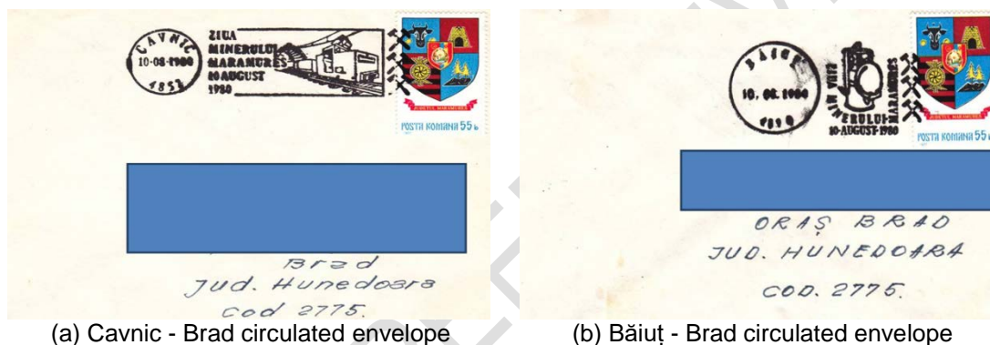
Fig. 11. Different envelopes with the occasional stamp

In Fig. 11a [44] we have reproduced a letter circulated from Cavnic to Brad (Hunedoara County), in which the stamp of the event was used as a "day stamp" for postage stamps. The piece reached its destination on August 12 (after two days), as can be seen on the arrival stamp applied on the back of the envelope. The stamp used to stamp the correspondence is the one that present the coat of arms of the county of Maramureş from the usual program "The coat of arms of the counties from R.S. Romania "(LP #942) published on September 5, 1977. And this stamp is in the specifics of the mining theme because in the upper right corner an entrance to the mine is illustrated. Even in Băiuţ there were events organized for this occasion. The stamp applied here presents a mine lamp framed by the legend "MINER'S DAY / MARAMUREŞ / 10-AUGUST-1980" and bordered, on the right, by the symbol of the chisel and the hammer. In Fig. 11b [45] we find a letter circulated from Băiuţ to Brad bearing the special stamp of the event. This letter also reached its destination in two days. For those who were curious to follow the sources cited, they could see that the last two reproductions circulated have the same sender Dobra Ioan - a Baia Mare philatelist of the time. Perhaps readers who do not know the Maramures area very well will wonder how this person managed to be in two locations at the same time.