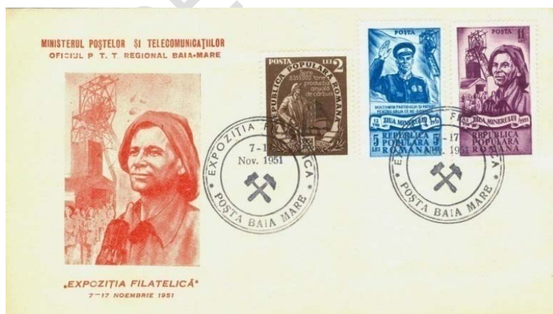
Fig. 1. Occasional envelope - 7-17.11.1951 - "Philatelic exhibition" in Baia Mare

During the period November 7-17, 1951, in Baia Mare, the first philatelic exhibition in the county, held to celebrate "Miner's Day" was organized. With this exhibition, an occasional envelope (see Fig. 1) was published by the Ministry of Posts and Telecommunications through the P.T.T. Regional of Baia Mare [11, 12]. It is worth mentioning that, after the exhibition in Constanța in July of the same year, the exhibition hosted in Baia Mare was the second philatelic exhibition in the country. For the creation of this philatelic piece, the first one with this theme addressed in our county has used the image used to make the envelope "the first day" (FirstDayCover - FDC) of the issue "Miner's Day" appeared on August 12, 1951. This time the color of the pattern was red, and the legends were changed.