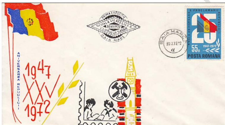
Fig. 6. Occasional envelope made by the Săsar Philatelic Club from Baia Mare in 1972

In 1972, on December 30, on the occasion of the 25th anniversary of the Republic's establishment (1947-1972), the club organizes the first edition of the exhibition "The philatelic school of the Săsar Club". The occasional envelope (see Fig. 6) [34, 35], printed in color (in three colors), has the legend "Anniversary of the Republic / 1947 / XXV / 1972", and in the graphic composition is the symbol of the two flags (one having the red of the party and the other the tricolor), the "Stefan" tower, a stamped corner in which the image of two young philatelists are reproduced, as well as the emblem with the chisel, the hammer and the candle of the miner (the reason why we selected this piece in the theme of our work). In the central, upper part, the philatelic piece has the stamp, in black ink, with the description "First exhibition / The philatelic school of the Săsar Club / 30.12.1972 / Baia Mare", having as a graphic element a stamp of rhomboidal form.