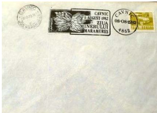
Fig. 13. Envelope with the stamp "Miner Maramures Day 1982", Cavnic

Every year, "Miner's Day" would not be celebrated on the same date. For example, in 1982 it was to be celebrated, at Cavnic, on August 8. This time the stamp (Fig. 13) [48] was to bear the artistic signs of an artist passionate about the abstract. The connection between the stylization of the mineral and the legend of the stamp "Cavnic / August 08, 1982, / Day / Miner / Maramureș" was made in interlocking boxes, the circle with the date and the place of the shipment being located on the right, with the role of forgetting the stamp with which it was equipped.