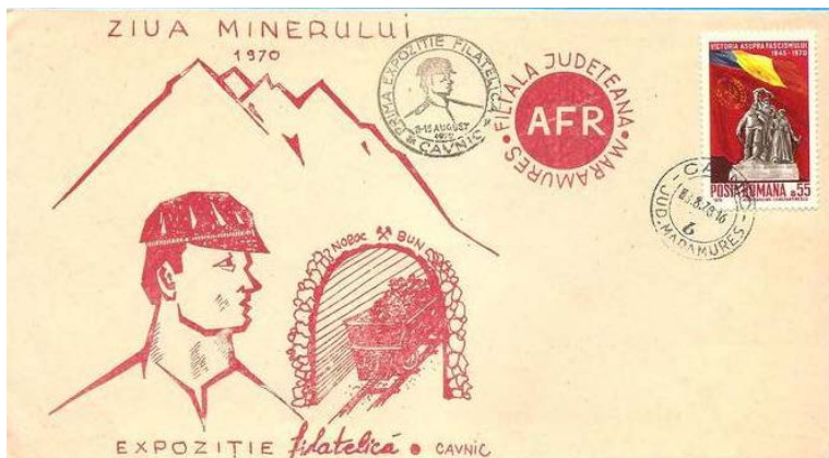
Fig. 4. Envelope - The First Philatelic Exhibition in Cavnic, "Miner's Day - 1970"

The envelope was stamped with the stamp of the show "Victory on Fascism" (LP #727) which appeared on May 9, 1970, and was obliterated by the day stamp of the Cavnic Post Office on August 3, 1970. The exhibition stamp in which the miner's face appears in the illustration of the occasional envelope was presented in a complementary black ink, next to the AFR logo. Established in 1970, the Baia Sprie Philatelic Circle has enjoyed from the beginning an active and creative collection. In this context, even in the second year of existence, the group holds its first philatelic exhibition, which took place on May 1-25, 1971. The occasional envelope of Fig. 5 [33] presents in semi-illustration a convoy of ore wagons loaded at the mouth of the mine in the city of Baia Sprie, having above them a laurel wreath that fits the party flag (PCR), as well as the text "May 8, 1921-1971". It is printed using two colours for the first time in Maramures.