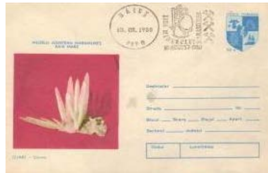
(b) variant B