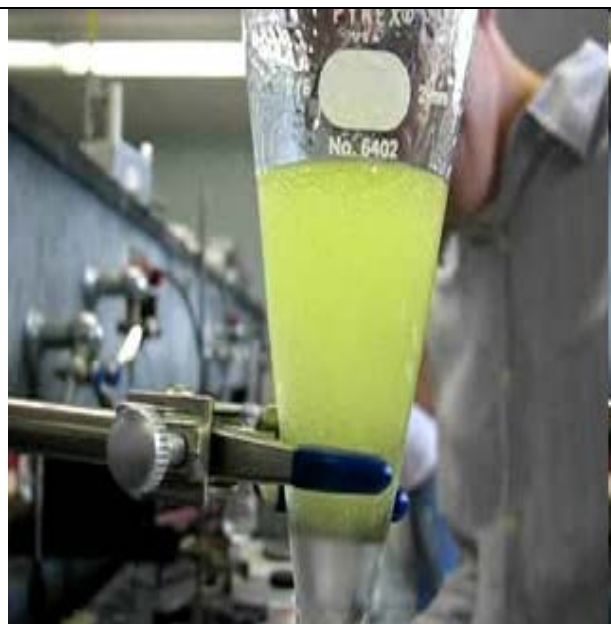
Fig 1 a. Process of transfer of a dissolved substance from one phase to another phase, which are immiscible or restrictedly miscible, is called liquid-liquid –partition or partition between two phases of liquids.