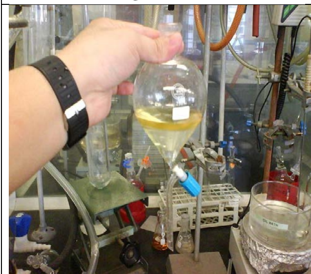
Figure 1 c. Laboratory-scale liquid-liquid extraction. Photograph of a separatory funnel in a laboratory scale extraction of 2 immiscible liquids: liquids are a diethyl ether upper phase, and a lower aqueous phase.