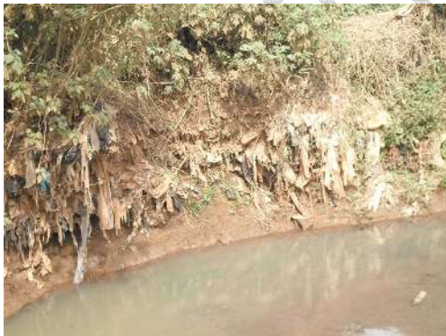
Figure 2: (a) Soil profile some with artifacts (b) adjacent river banks of the wetland of Bamenda Municipality Cameroon with artifacts