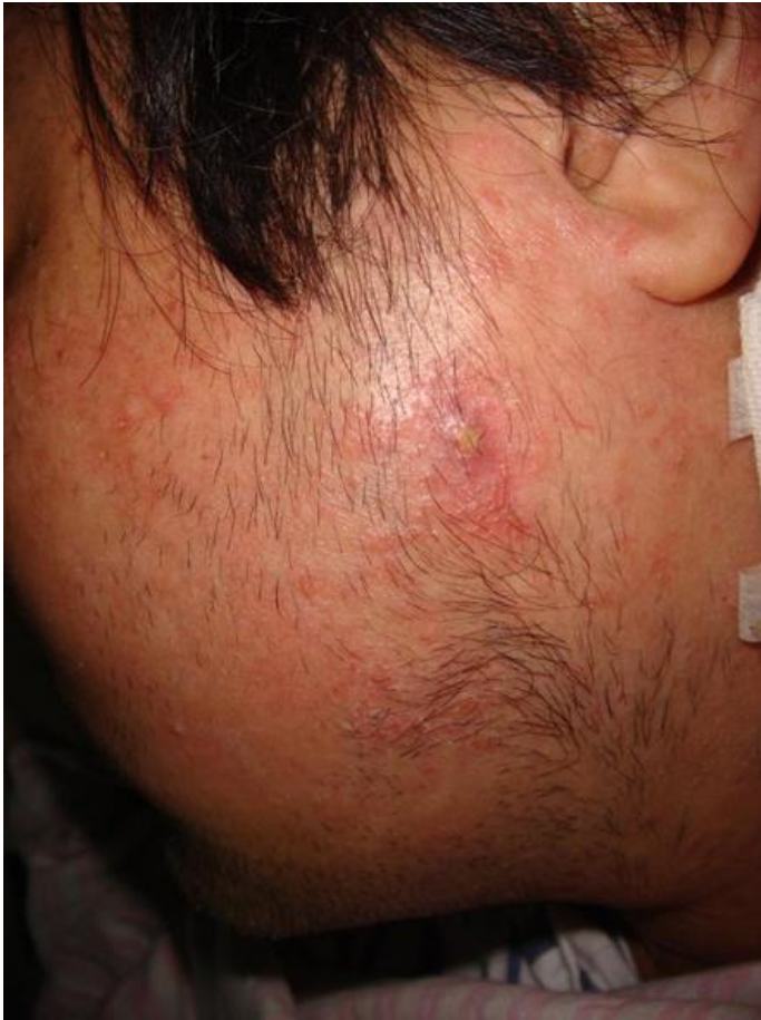
Figure 1 The patient's fistula and swelling from mandibular osteomyelitis in his left cheek.