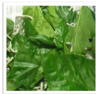
Dorsal side of mulberry leaves spread with inoculum were fed to 1 st day of 5 th instar larvae