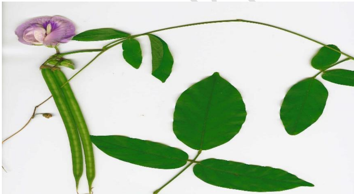
Figure 1: Centrosema pubescens plant, notice the slender stem, flower, triple leaflets and long pods with seeds.

Twelve (12) buckets were simulated with varying concentrations of the cassava mill effluent namely: 10%, 20%, 30%, 40%, 50% and 100% vol/vol pollution for Centrosema pubescens and Calopogonium mucunoides . The other two (2) buckets without effluent treatments (0%) served as the controls for Centrosema pubescens and Calopogonium mucunoides . The plants were watered with the corresponding concentration of effluent and observed daily for 14 weeks and the effects of the effluents on the plants studied. At maturity, they were harvested and analyses were carried out to evaluate the rhizosphere organisms, rhizosphere soil physico-chemical properties, nitrogenous salt levels in the simulated soils and metal loads as described by AOAC, (1984); Sofowora, (1993); Egwaikhide and Gimba, (2007); Mofunanya et al. , (2007); Gafar et al. , (2010); Chandrappa et al. , (2011), Mofunanya and Nta, (2011); John et al. , (2011); Agbo and Mbotto, (2012) and Agbo et al. , (2019).