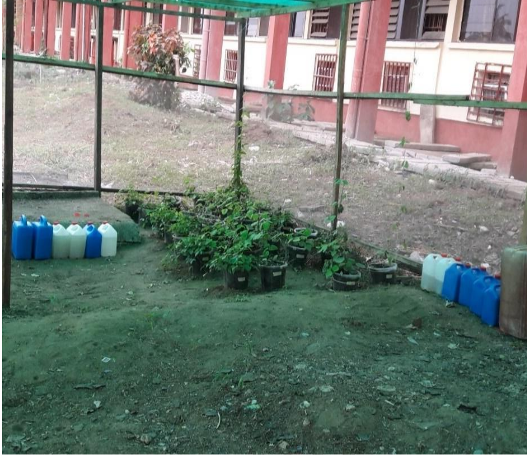
Figure 3: Simulation experiment in-progress; Notice the legumes arranged in column with the varying concentration of effluent labeled on the bucket.