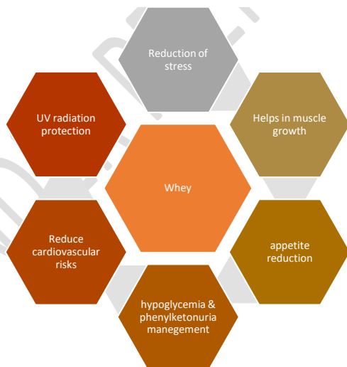
Figure-3 showing the health benefits of whey proteins in various forms