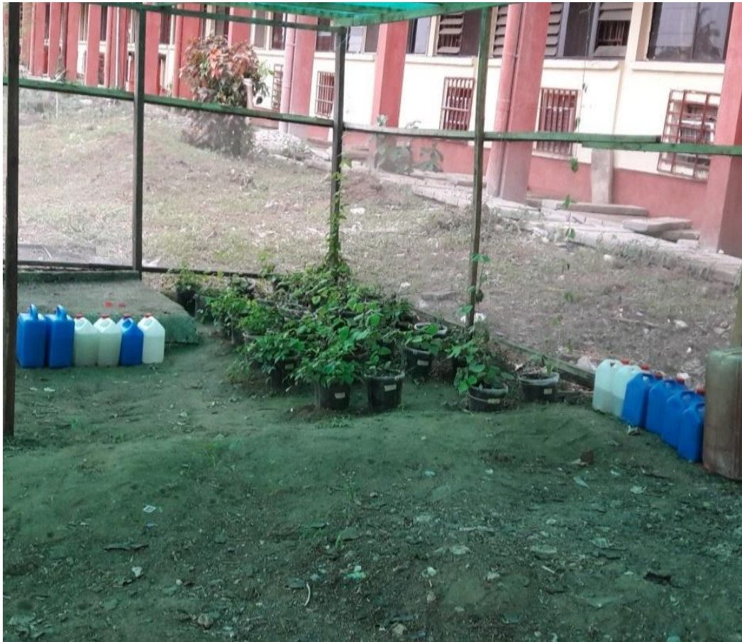
Figure 3: Simulation experiment in-progress; Notice the legumes arranged in column with the varying concentration of effluent labeled on the bucket.