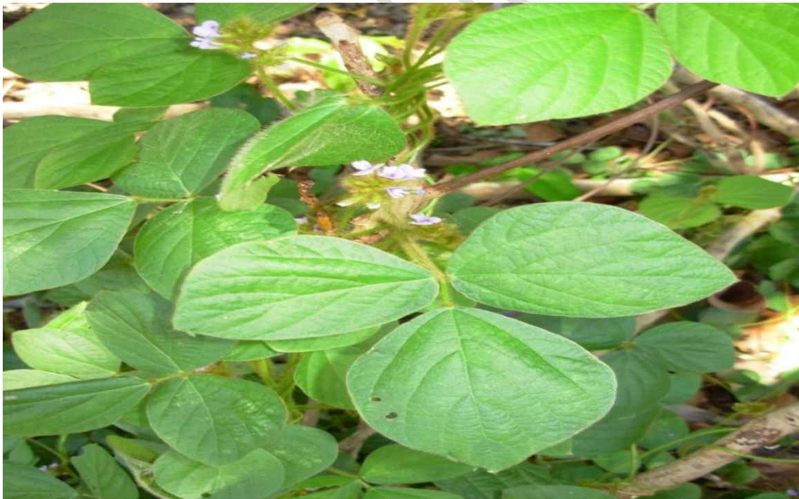
Figure 2: Calopogonium mucunoides plant, a hairy annual or short-lived perennial trailing legume.