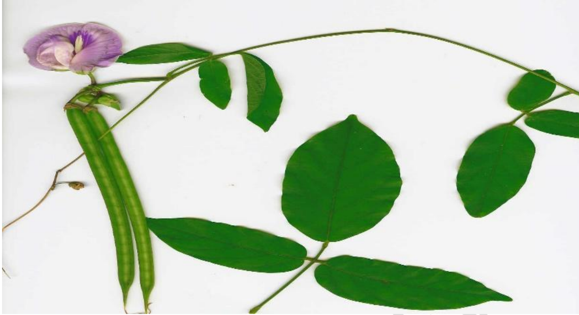
Figure 1: Centrosema pubescens plant, notice the slender stem, flower, triple leaflets and long pods with seeds.